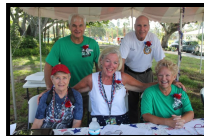
Parade Judges - BSFD CERT Team Members