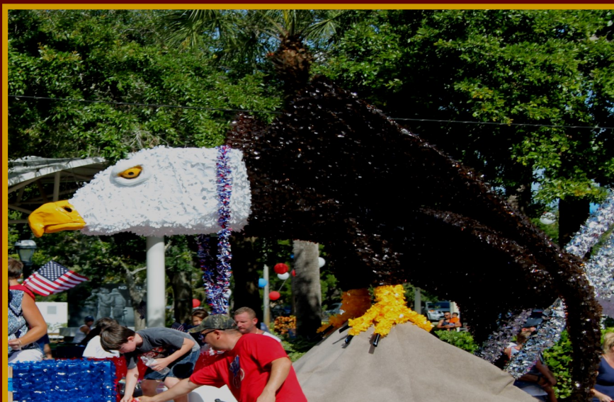
2016 Overall Parade Winner Bonita Springs Utilities